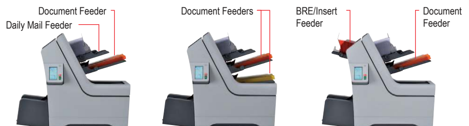
6206-Basic 1 One Document Feeder

OMR/BCR are available options, and the 6206 Series has advanced scanning capabilities to read codes printed horizontally or vertically, anywhere on the page.