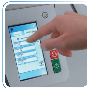
User-friendly color touchscreen control panel with job set-up wizard

* Paper & envelope specifications may vary. All media must be tested.