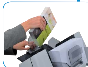
Automatic BRE/Insert Feeder can hold up to 250 BREs or 700 cards, depending on thickness

Formax - New Hampshire, USA www.formax.com