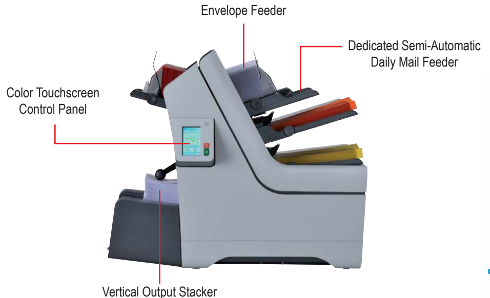
FD 6206-Advanced 2 with two Document Feeders and BRE/Insert Feeder