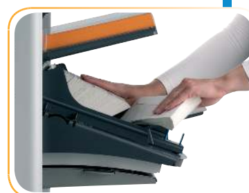
Optional Production Feeder