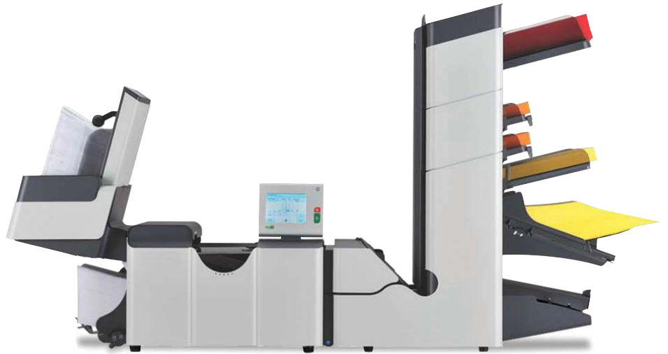
6404 Series, shown with High-Capacity Document Feeder, optional Short Feed Trays, and optional High-Capacity Production Feeder