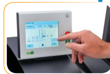
Color Touchscreen Control