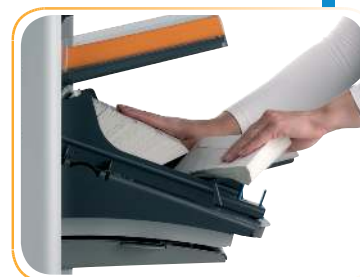
Optional Production Feeder