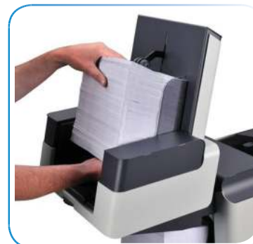
High-Capacity Vertical Output Stacker