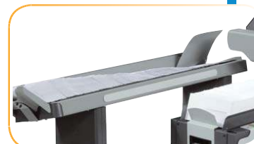
Optional High-Capacity Envelope Hopper and Output Conveyor - Each can hold up to 1,000 envelopes

Formax - New Hampshire, USA www.formax.com