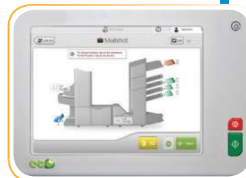
Paper Presence Sensors & Graphical On-Screen Display