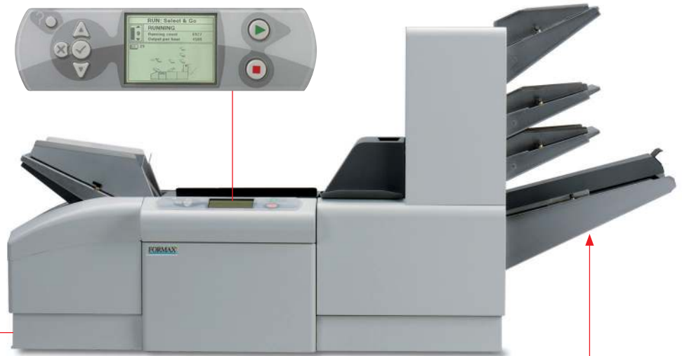
FD 7100-Basic 3 w/ Optional Accumulator