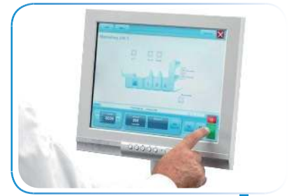
15" Color Touchscreen Interface

* Paper & envelope specifications may vary. All media must be tested.