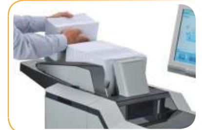
High-Capacity Envelope Feeder