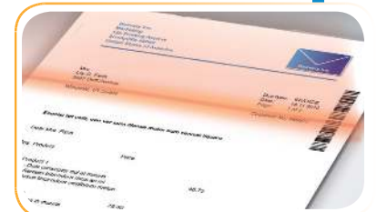
Full-page scanner reads a variety of codes, anywhere on the page