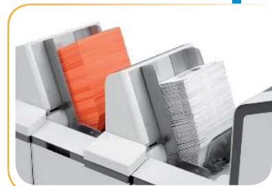
High-Capacity Versatile Feeders