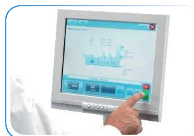
15" Color Touchscreen Interface