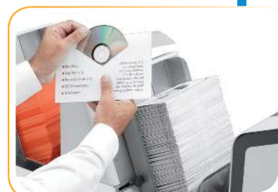
Feeds a variety of media