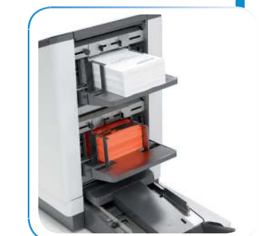
Tower Feeder w/ High-Capacity Trays and Accumulation/Divert Deck

Formax - New Hampshire, USA www.formax.com