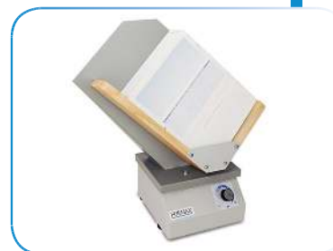
402 Series Jogger - an option which reduces static electricity from forms and aligns them for proper feeding