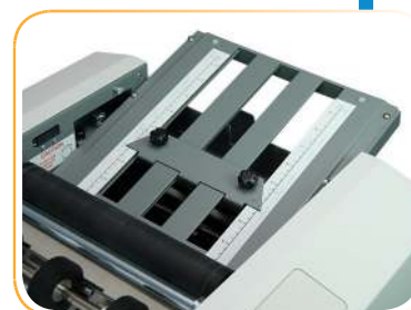
Redesigned fold plates - Clearly marked and easier to adjust