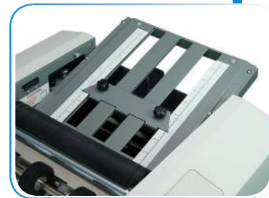
Redesigned fold plates - Clearly marked and easier to adjust

The FD 1502 Plus is designed for user-friendly operation. Simply set your folds according to the clearly marked settings on the fold plates, load your forms using the drop-in feed system, press start and you're on your way. The FD 1502 Plus has LED indicators for power on, fault detection, paper out and cover open. It also includes a six-digit counter for audit control and an integrated output conveyor.