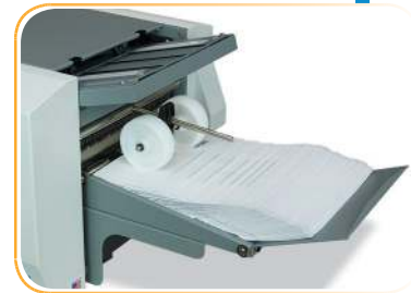
Integrated Output Conveyor

The FD 1502 Plus is built with proven Formax technology. Heavy-duty steel construction offers the dependability and power expected of a larger unit in a smaller package. A hopper capacity of up to 200 forms and processing speed of up to 6,250 forms per hour enables an operator to complete daily jobs in no time. Plus, the integrated output conveyor keeps processed forms in a neat, sequential order.