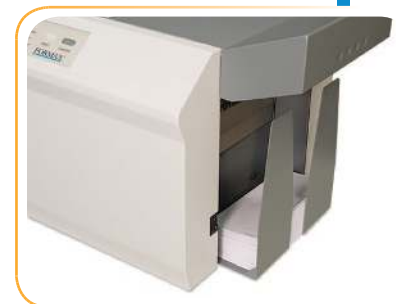
Standard Catch Tray