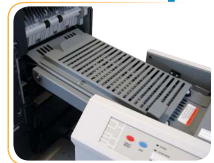
Enclosed paper path provides optimal document security

The FD 2002IL processes forms securely in a compact and powerful design. The user-friendly control panel features LED indicators and a six-digit resettable counter. The FD 2002IL is built in the USA with proven Formax strength and reliability.