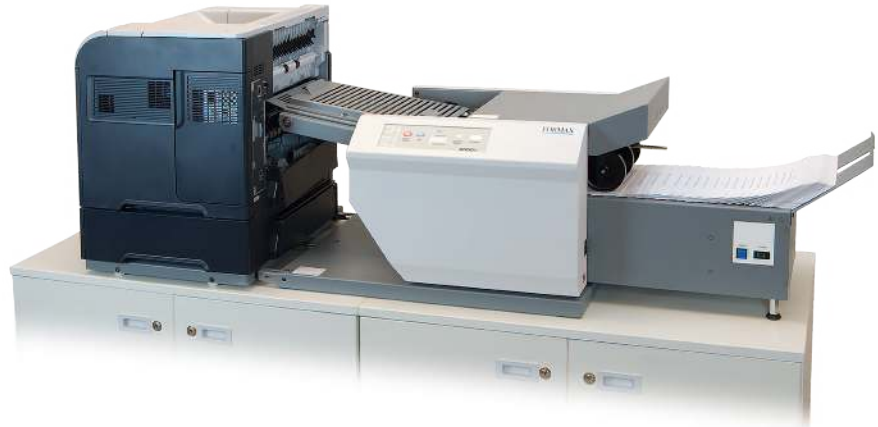
FD 2002IL System shown with IL Pressure Sealer and Alignment Base, laser printer (not included), and optional locking cabinets and 18" conveyor