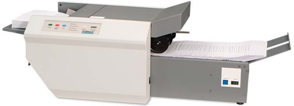
Shown with optional 18" conveyor

The FD 2032 AutoSeal ® desktop pressure sealer provides a reliable and compact solution for processing pressure sensitive self-mailers. Up to 350 forms can be loaded in the hopper and processed at speeds up to 11,000 forms per hour.