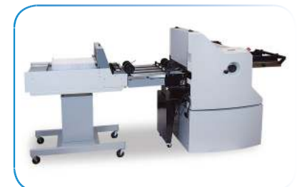
FD 2094 in-line with optional V-Stack36 Vertical Stacker and adjustable stand