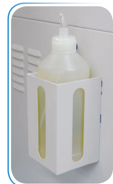
Optional EvenFlow™ Automatic Oiling System

Formax - New Hampshire, USA www.formax.com