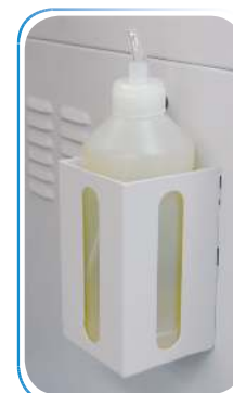
Optional EvenFlow™ Automatic Oiling System

*Capacity varies depending on paper and power supply