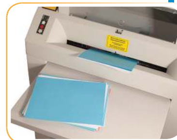
Fold-out shelf makes feeding easier