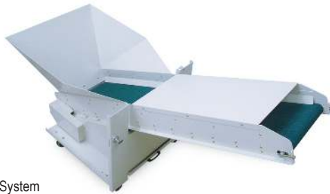
Output Conveyor Belt System

The FD 8904CC has an optional Output Conveyor Belt System which transports material out of the shredder and into an external waste bin, increasing capacity and decreasing down time between emptying and replacing the waste bin.