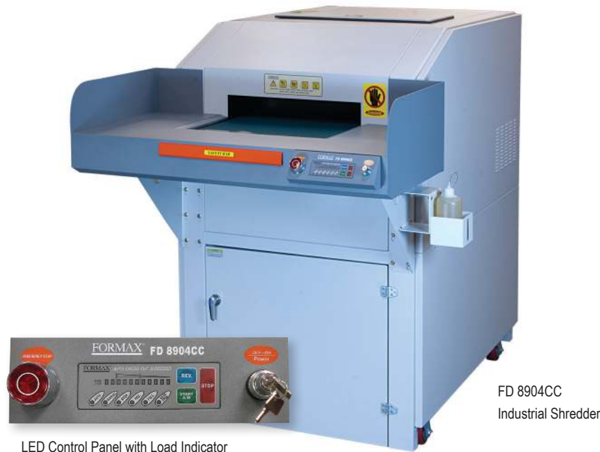
LED Control Panel with Load Indicator