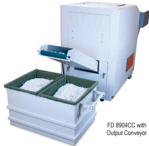
FD 8904CC with Output Conveyor