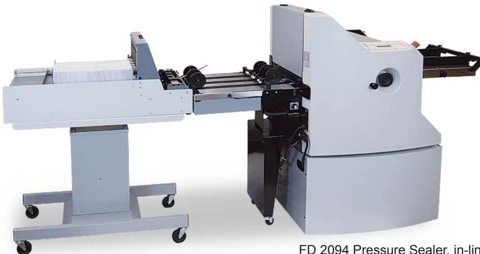
FD 2094 Pressure Sealer, in-line with V-Stack36 Vertical Stacker and V-Stack36-10 Adjustable Stand.

Note: Stand is not required for use with Formax tabletop models. The V-Stack36 infeed is designed to align with the sealer's outfeed on a tabletop or cabinet.