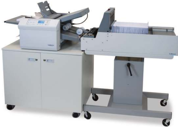
FD 38X Document Feeder and V-Stack36 Vertical Stacker, shown with optional V-Stack36-10 Adjustable Stand and cabinet.

Note: Stand is not required for use with Formax tabletop models. The V-Stack36 infeed is designed to align with the folder's outfeed on a tabletop or cabinet.