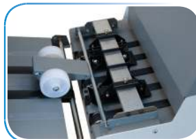
Guide wheels and six-ball-roller deck ensure forms enter the stacker smoothly