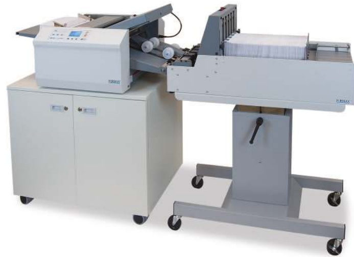
FD 2054 Pressure Sealer and V-Stack36 Vertical Stacker, shown with optional V-Stack36-10 Adjustable Stand and cabinet.

Note: Stand is not required for use with Formax tabletop models. The V-Stack36 infeed is designed to align with the sealer's outfeed on a tabletop or cabinet.